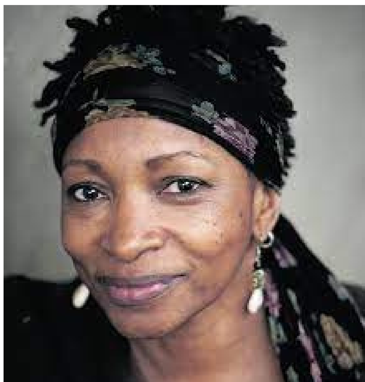
Bonnie Greer OBE