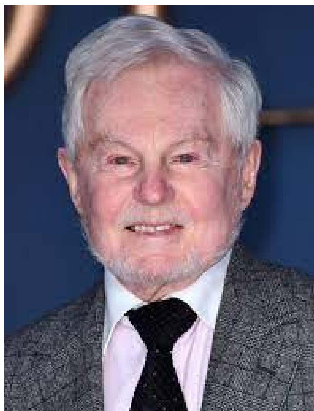
Sir Derek Jacobi CBE